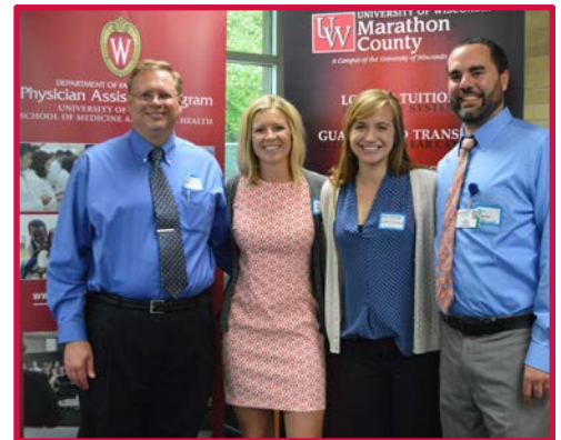
wisPACT@UW–Stevens Point at Wausau’s first graduates

Developed through a successful Health Resources and Services Administration (HRSA) grant, the distant campus allows students to remain in northern Wisconsin for their physician assistant education. There, they attend live lectures and discussions through videoconferencing between the UW–Stevens Point at Wausau campus and