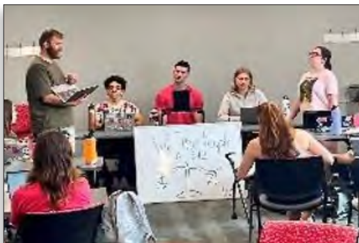
Class of 2026 Debate in the ethics course.