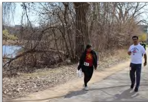
Bucky's Race 2025