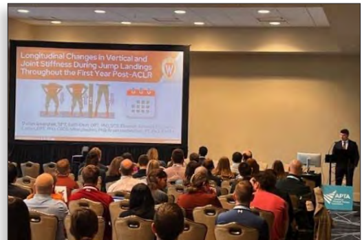
CSM 2025 platform presentation by DPT-3 student.