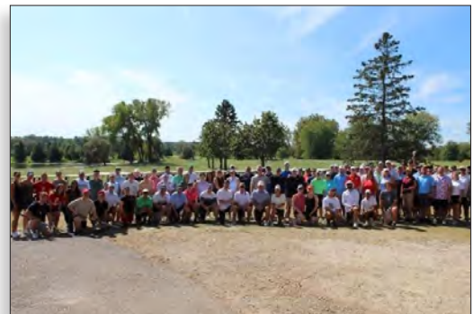
Participants at the 2025 DPTSO Golf Outing.