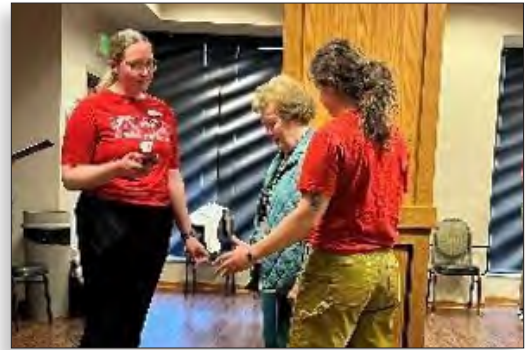
Students participating in a Falls-Prevention Community Event.