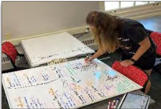
Preparing for an exam in the collaborative classroom.