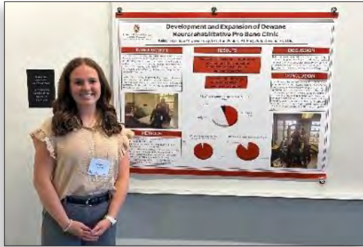
DPT-3 student presenting at Medical Education Day 2025.