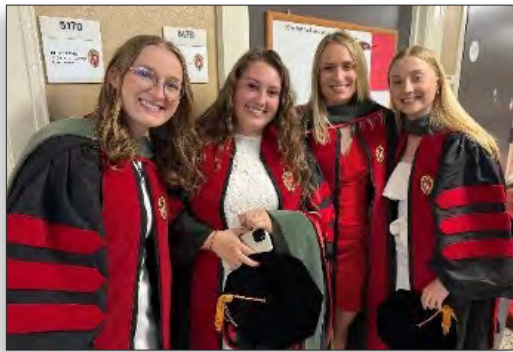
Class of 2025 Graduation Open House.