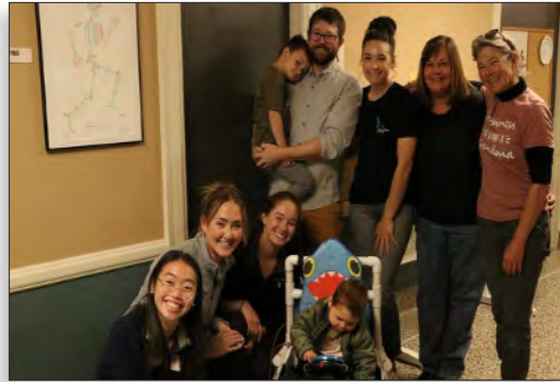
Go Baby Go 2025