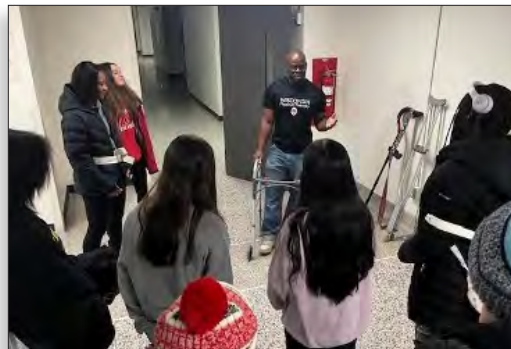
A DPT-2 student educating students from Madison School District.