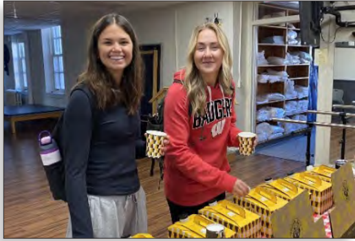
SMPH Financial Aid and Financial Wellness Advising provides students bagels and coffee to assist them in answering financial questions.

Please enjoy the collage of pictures highlighting students from this past year's activities!